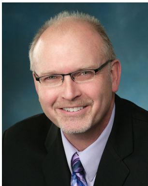
Senator Roger Chamberlain R-Lino Lakes 38

The legislators pictured below RECEIVED THE HIGHEST SCORES ON OUR LEGISLATIVE SCORECARD . They deserve special recognition for their efforts to limit the growth and reach of State Government and are the 2015 "FREINDS OF THE TAXPAYER." Senator Dave Osmek noted with an orange border in addtion to his 100% score deserves special recognition for signing the taxpayers protection pledge and is the 2015 "BEST FREIND OF THE TAXPAYER."